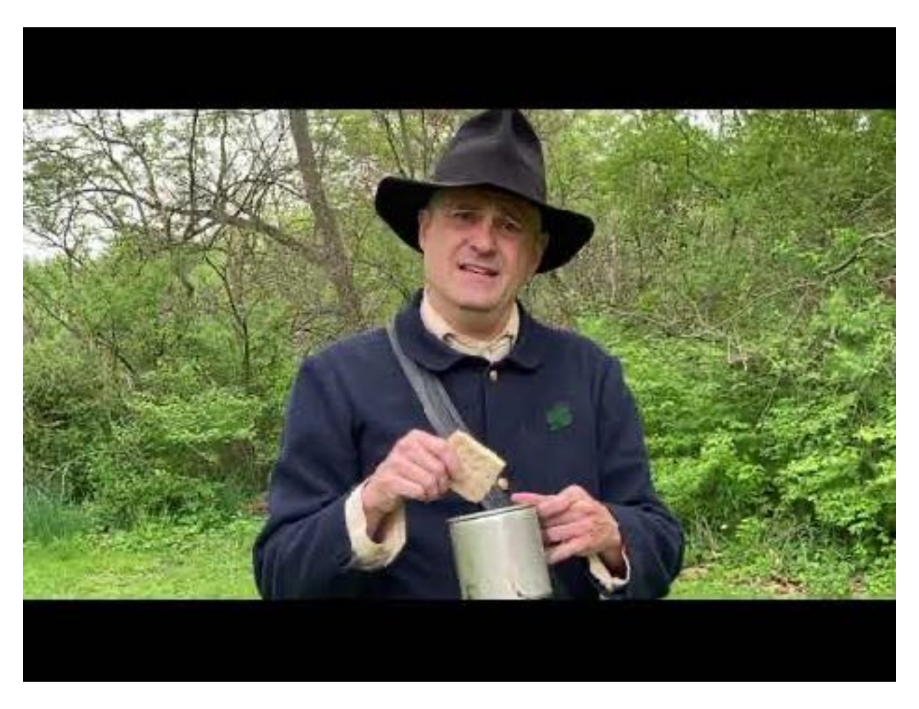
(View project at <a href="https://www.youtube.com/watch?v=G5mZekjmXOw">https://www.youtube.com/watch?v=G5mZekjmXOw</a>)